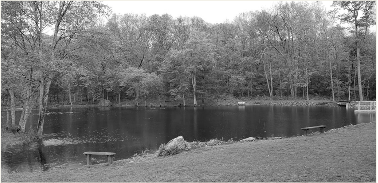
Garrison Park Pond, courtesy Chaplin Recreation Commission