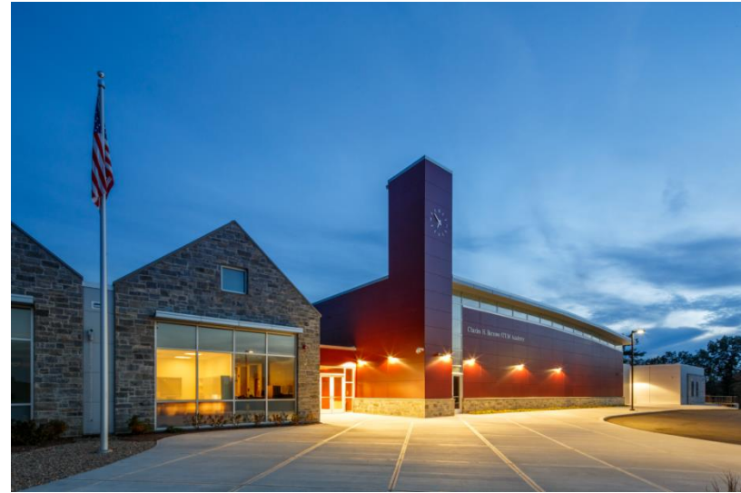
Barrows STEM Academy (K-8, 600 students), Windham