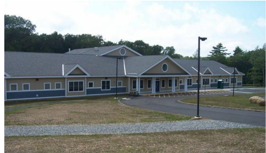
Union School (K-8, 70-80 students), Union