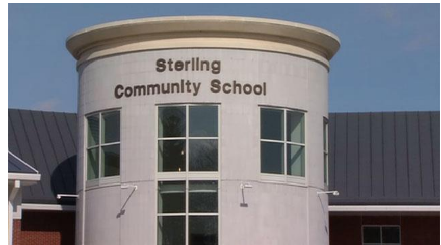
Sterling Community School (K-8, 480-500 students), Sterling