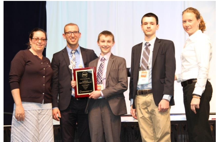
Pomperaug High Academy of Digital Arts and Sciences won top award at the CT Student Innovation Expo